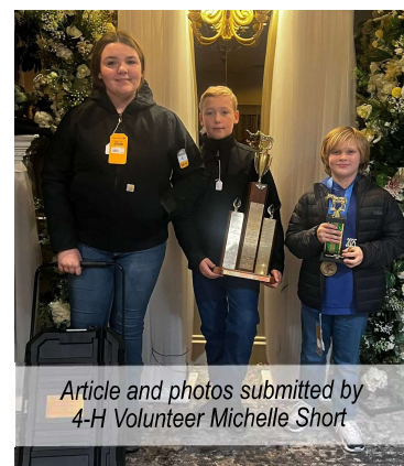
Article and photos submitted by 4-H Volunteer Michelle Short